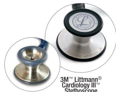
3M™ Littmann® Cardiology III™ Stethoscope

You deserve the best and so do your patients. Invest in a Littmann cardiology-grade stethoscope now to enhance your learning ability and the care you provide to your patients.