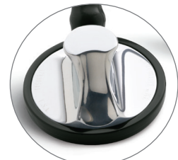
3M™ Littmann® Master Cardiology™ Stethoscope