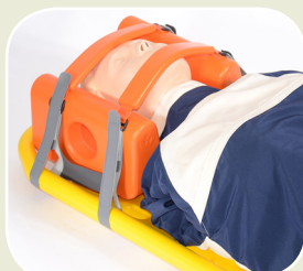
How straps work with Millennia board