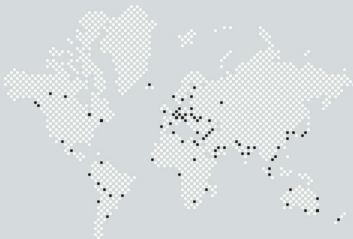
■ HEINE SUBSIDIARY COMPANIES & REPRESENTATIVES

We look forward to hearing from you – and would like to know more about your opinions, desires and suggestions regarding our products.