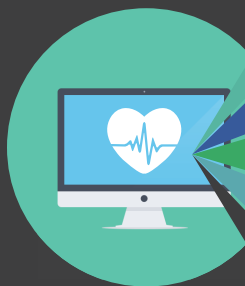
Welch Allyn CardioPerfect WorkStation Software

The Welch Allyn ABPM 7100 connects with CardioPerfect Workstation software to enable you to easily create, print and customize detailed reports: