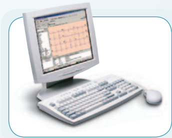
Welch Allyn CardioPerfect Workstation