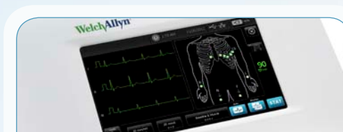
LEAD QUALITY DISPLAY

No need to track between the display and keyboard, saving time and helping reduce errors.