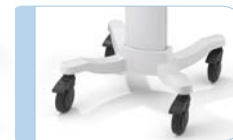
Model Shown here with hospital-grade wheel option

Accessory Choices: AHA, IEC, reusable/disposable electrodes