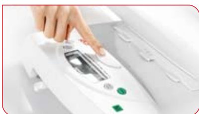
The weighing tray can be removed quickly and easily at the touch of a button.