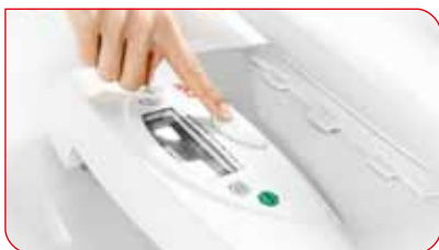
The weighing tray can be removed quickly and easily at the touch of a button.