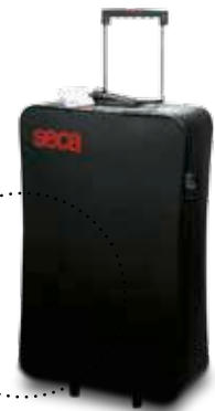
With plastic wheels and retractable handle.