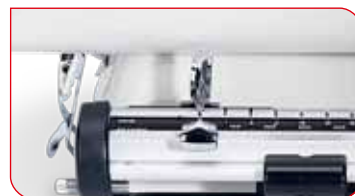
The reset-to-zero function guarantees reliable determination of net weight by simply deducting the extra weight of padding or diaper.