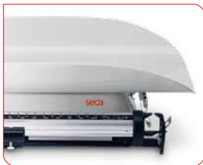
To simplify cleaning, weighing tray can be removed.

The weighing tray is easy to remove from the base for cleaning. The hard-wearing, scratch-proof finish and the smooth, seamless surface makes the seca 745 extremely easy to clean. The scale can be safely stored and is easy to transport in the optional carrying case seca 425.