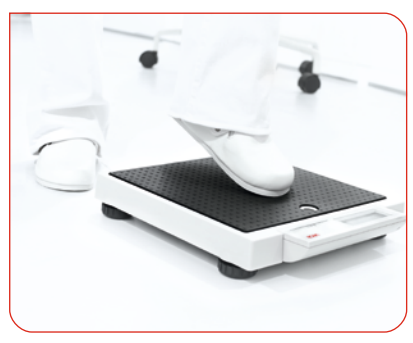
Tap-on function for weighing without turning on the scales.