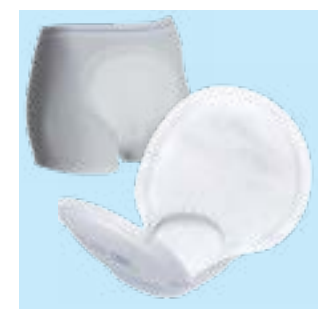
Body-worn Pads with Mesh Brief

Design and evaluation of a new method designed to assess the usability of body-worn absorbent incontinence care products for lay caregivers were completed. The evaluation included evaluations of effectiveness (product fit), efficiency (time and physical workload), and satisfaction. Cameras were installed to monitor task performance; product changes and postures were timed by test moderators; product fit was evaluated based on defined product fit scores, and satisfaction scores were based on an eight-question questionnaire tailored to target areas of importance when changing absorbing incontinence products. Supplementary information can be found here: http://links.lww.com/JWOCN/A44