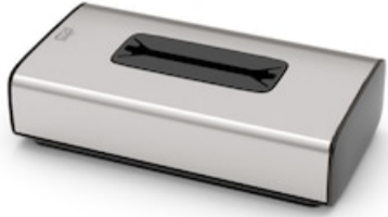
Tork Facial Tissue Dispenser SS