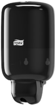
Tork Mini Liquid Soap Dispenser Black 561008