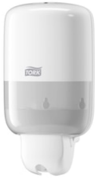
Tork Mini Liquid Soap Dispenser White 561000