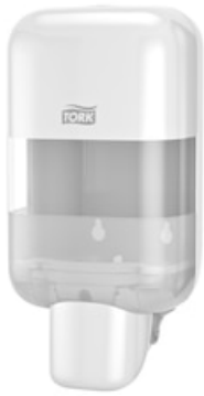
Tork Mini Soap&Sanitizer Disp.Wh 565200