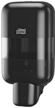
Tork Mini Soap&Sanitizer Disp.Bl 565208