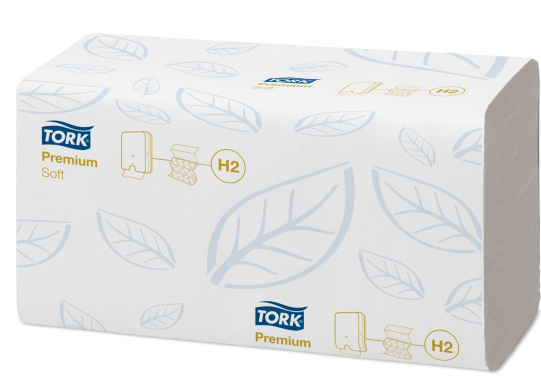
Tork Xpress Soft Multifold HT Prem 2p Z 100289