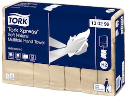
Tork Xpress Soft Multif Nat HT Adv 2p Z 130299