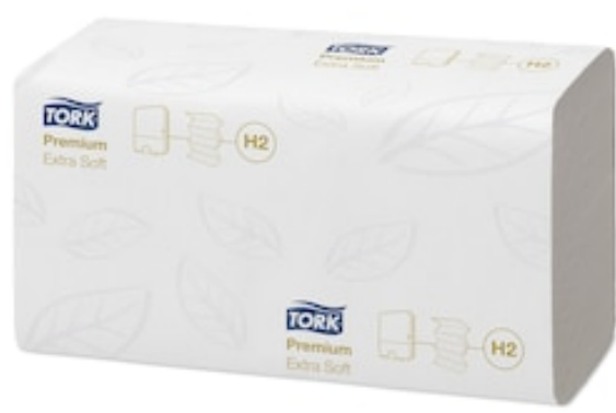
Tork Xpress XSoft Multifold HT Prem 2p M 100297