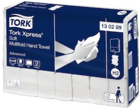
Tork Xpress Soft Multifold HT Adv 2p Z 130289