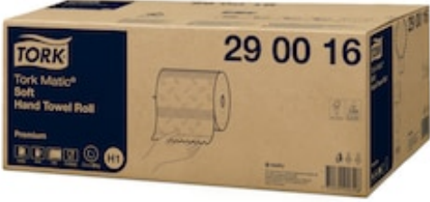
Tork Matic Soft HTR Prem 2p 100m 290016