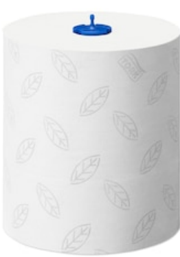
Tork Matic Soft HTR Adv 2p 150m 290067