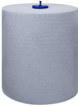
Tork Matic Blue HTR Adv 2p 150m 290068