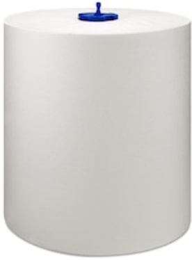
Tork Matic Extra Long HTR Univ 1p 280m 290059