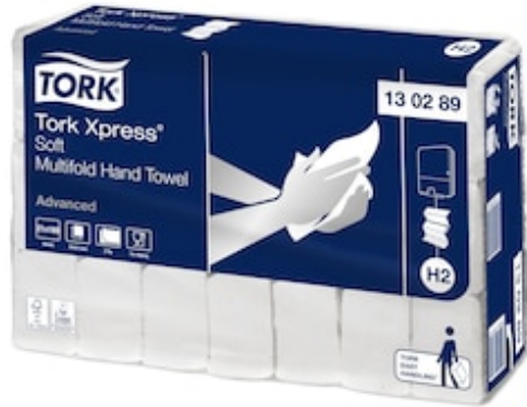
Tork Xpress Soft Multifold HT Adv 2p Z 130289