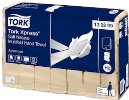
Tork Xpress Soft Multif Nat HT Adv 2p Z 130299