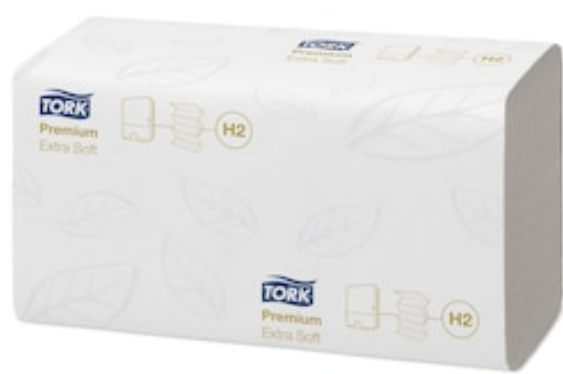
Tork Xpress XSoft Multifold HT Prem 2p M 100297