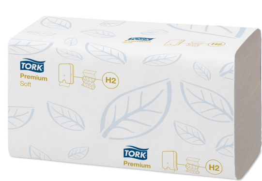
Tork Xpress Soft Multifold HT Prem 2p Z 100289