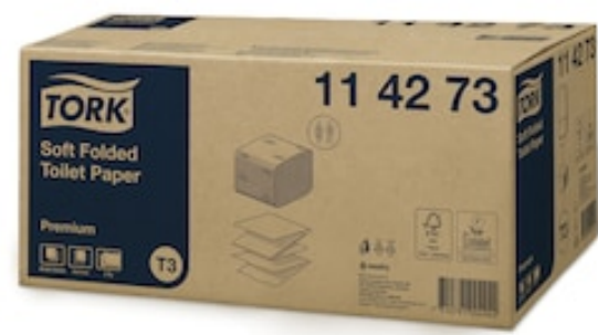
Tork Folded Toilet Paper Prem 2p 252s 114273