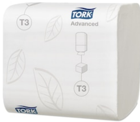
Tork Folded Toilet Paper Adv 2p 252s 114277