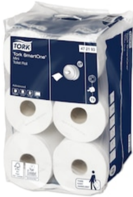
Tork SmartOne Mini TR Adv 2p 620s 472193