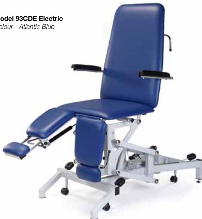
Model 93CDE Electric Colour - Atlantic Blue

This model features electric or hydraulic height operation with manually adjustable backrest and individually adjustable leg rests to aid positioning of the patient for podiatry procedures. The backrest has auto levelling armrests to provide support and comfort to the patient in sitting or semi-sitting positions. The backrest and leg sections can also be adjusted to fully support the patient in prone or supine positions for biomechanics or other procedures. A wide range of options are available to meet individual user requirements.