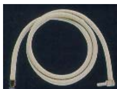
Air tube 1m