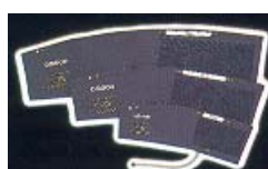
Small / Normal / Large Cuff