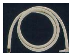
Air tube 1,3m

(without picture) Wall hanging kit Pole-mounting kit