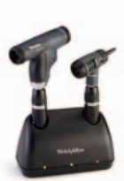
71811-MP Desk Charger Set