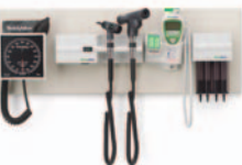
76791-2MPX Integrated Diagnostic System