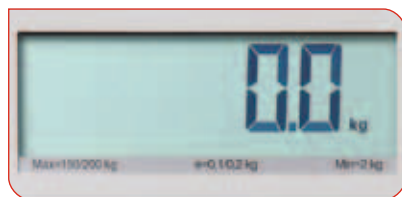
Large display for easy reading.