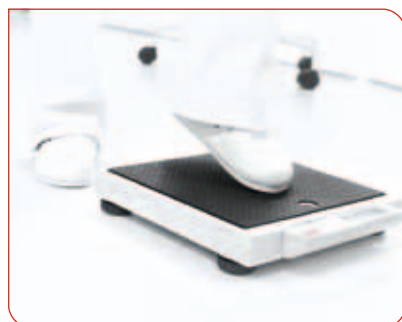
Tip-on function for weighing without turning on the scales.