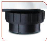
Large leveling base on the bottom of the scale for safe placement.