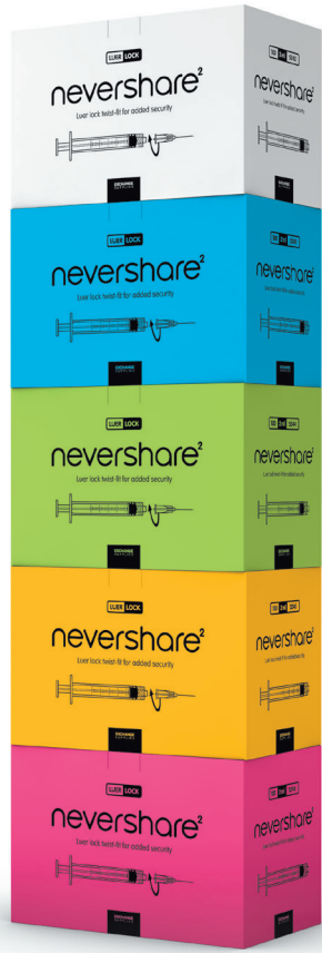
Box 100 210mm x 125mm x 140mm