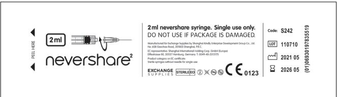
Blister 138.6mm x 39.5mm

None of these materials contain recycled content.