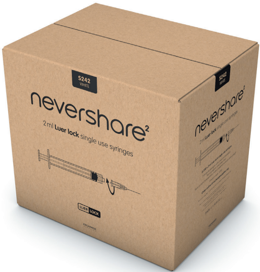
Carton 3,200 Dimensions: 585mm x 440mm x 545mm